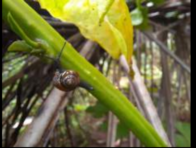
Garden snail Siddhesh Kolambkar, SYBSC B