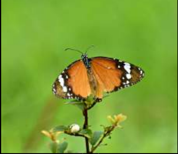
Plain Tiger Vinod Shekhar Kulal, SYBSc A