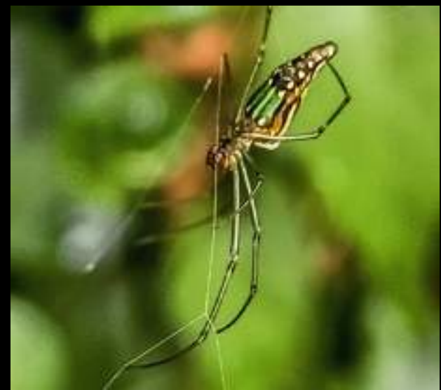
Leucauge argyra Gaurav Sunil Kuma Patil , SYBSC A