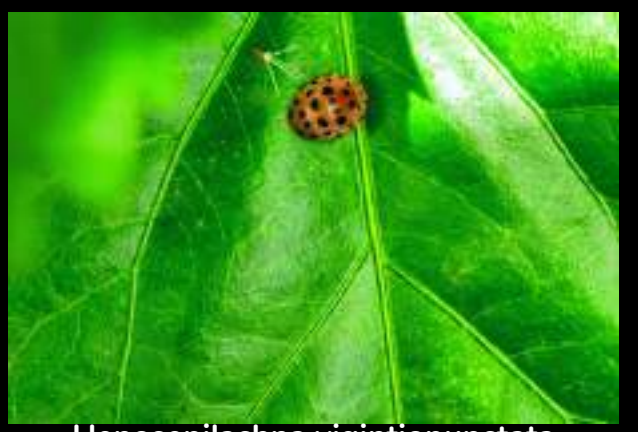
Henosepilachna vigintiopunctata Vedant Khokrale, SYBSC A